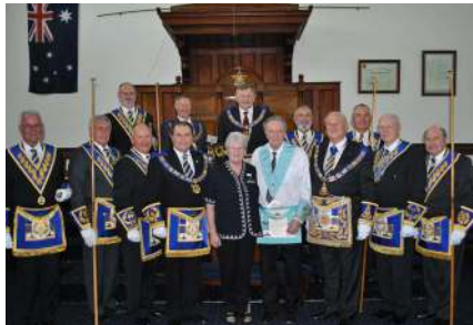
Grand Installing Team and Talbot Lodge Officers.