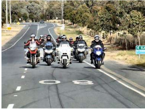
VMMA riders in pursuit of a good cause

The Victorian Masonic Motorcycle Association Inc. will conduct an 8 day charity fundraising ride around Victoria from 30 October to 6 November 2010. Named the 2010 'Breathless' Ride, it will encompass 3000 kilometres throughout Victoria in support of Cystic Fibrosis Victoria; an organisation which receives no government or business funding to support its members suffering from this debilitating disease.